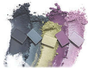
Mineral Eye Color $6.50