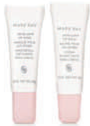
Satin Lips® Set $18