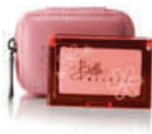
Fragrance Solid $26