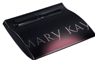
Compact (unfilled) $18