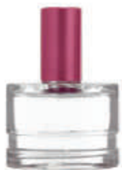
Eau de Toilette Fragrance $25