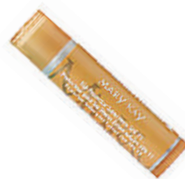
Lip Protector w/ Sunscreen $7.50