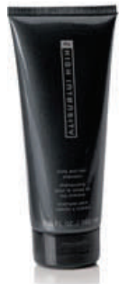
Body & Hair Shampoo $18