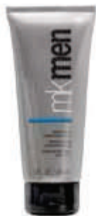
MKMen Moisturizer $22