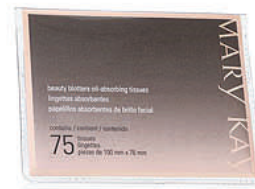
Beauty Blotters $5