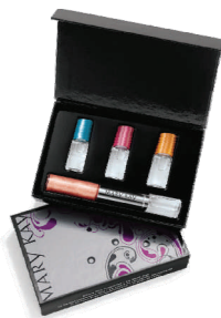
Simply Chic Fragrance/Lip Gloss $22