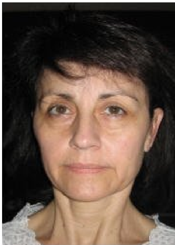
Before Picture Using Mary Kay's Miracle Set